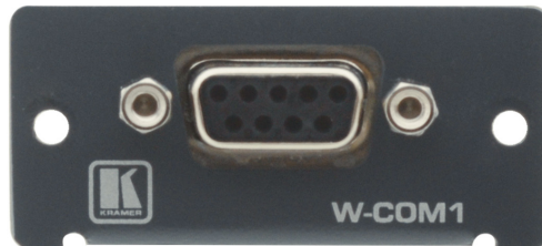
Figure 1: W-COM1 Wall Plate Insert

The W-COM1 is a single-insert COM port on a 9-pin D-sub connector (for use with RS-232, RS-422, and RS-485) with a terminal block at the rear.