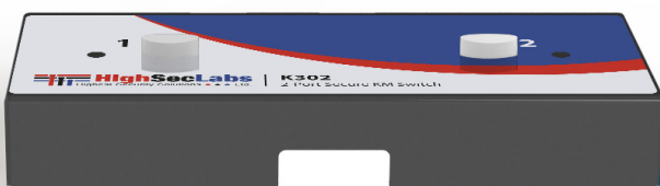
K302 - Front Panel